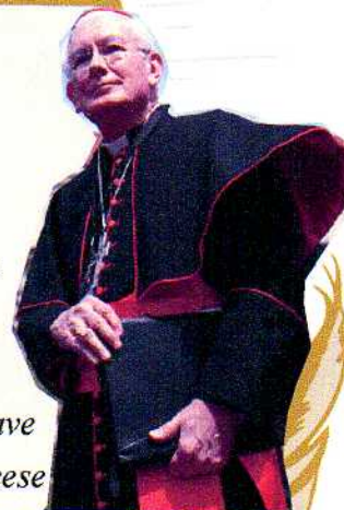
Above center cut-out: Retiring Cardinal William H. Keeler, 14th Archbishop of Baltimore